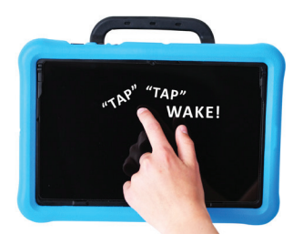
A simple double tap wakes the screen, making independent use easier for individuals who require different access to hardware buttons