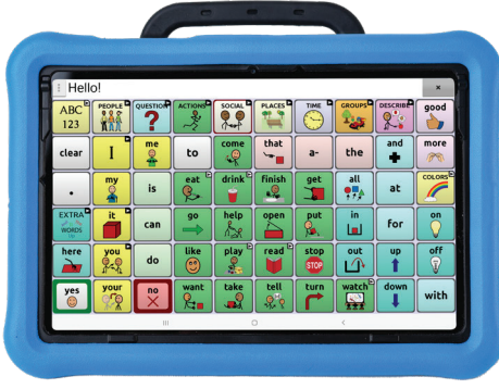
Specs, with handle: 11.5" L x 9" W x 1.9" D; Weighs 2.7 lbs.