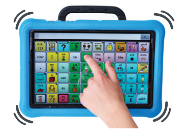
Small vibration via the haptic feedback function helps provide tactile input when making a selection